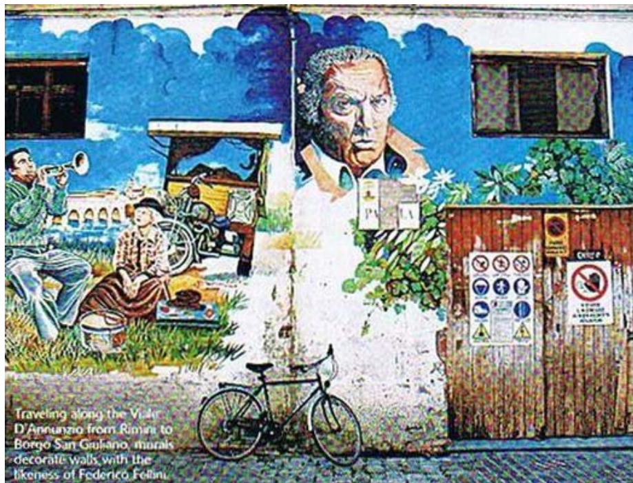
Traveling along the Via D'Annunzio from Rimini to Borgo San Giuliano, murals decorate walls with the likeness of Federico Fellini.

If Emilia-Romagna's food is collectively " la grassa ," then its wines might best be nicknamed " l'eccentrico ."